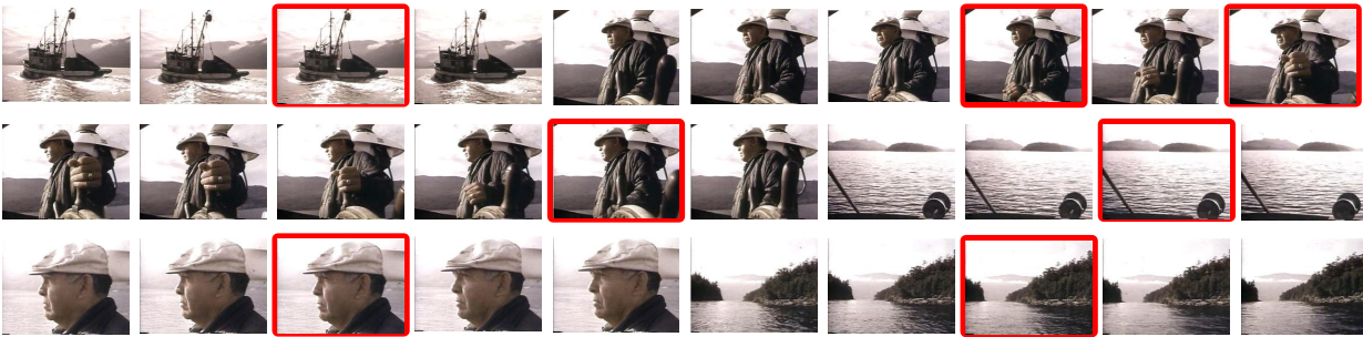
Fig. 2: Some frames of the New Indians multi-shot video and 7 representatives found by our algorithm. Those representatives bounded in red rectangles properly describe the whole frame sequences of the video. Since scene 2 contains more activities than other scenes, our algorithm finds 3 representative frames for scene 2 and 1 representative frame for other scenes. (best viewed in color)