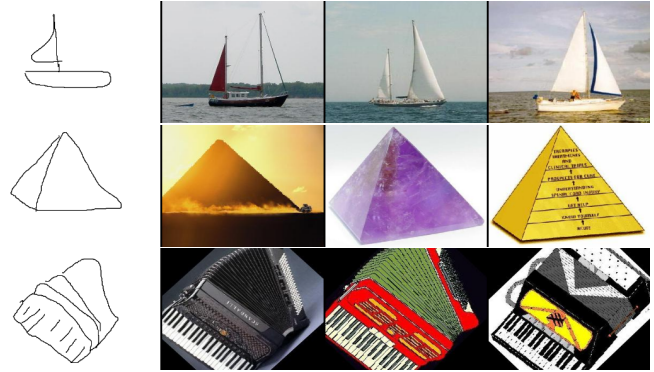
Fig. 4. These examples show the effectiveness of our proposal for retrieving similar images w.r.t. a query sketch. The figure shows the first three responses.

the used parameters. We can see from Table 2 that the size of HOG descriptor is lower than that of the S-HELO. This could seem unfair. We tried with similar sizes, but the perfor-