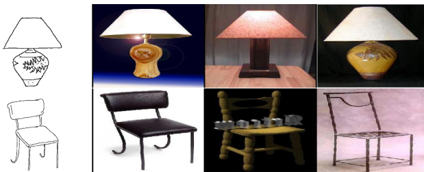
Fig. 3. Two examples of the retrieval performance of S-HELO. In these examples we are interested in retrieving a target image. The figure shows the first three responses.

the used parameters. We can see from Table 2 that the size of HOG descriptor is lower than that of the S-HELO. This could seem unfair. We tried with similar sizes, but the perfor-