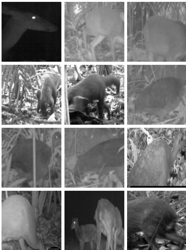
Fig. 2: The sample ROIs cropped out of the camera-trap images using EVOC [21].

The imagery data captured by the camera traps are image sequences triggered by a motion sensor with the sequence length ranging from 6 frames to 50 frames. Our previous work, EVOC [21] is first applied to the image sequence to segment out the moving foreground. The tight bounding box around the segmented region are selected as the Region of Interest (ROI). We can then treat the species recognition problem as the image classification on the ROIs. Some sample ROI cropped out of the camera-trap images are shown in Figure 2.