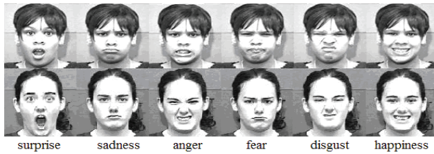
Fig. 2. Cropped face images from the Cohn-Kanade database.