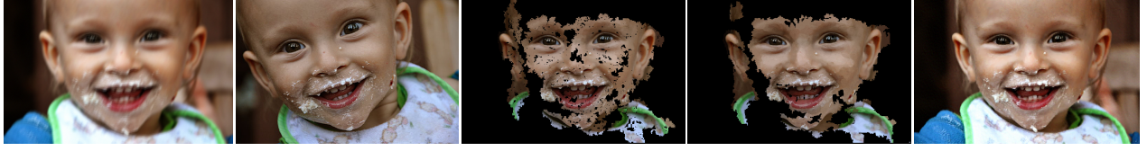
(a) blurry input (b) reference (c) with holes (d) after hole filling (e) final result

Figure 1. (c) and (d) compare the reconstructed image \mathbf{r}_M with and without step 8 (hole filling) of Algorithm 1. The confidence map \mathbf{w} (not shown) has high values where the colors in (d) are reconstructed and zero values otherwise; (e) is our final deblurred result.