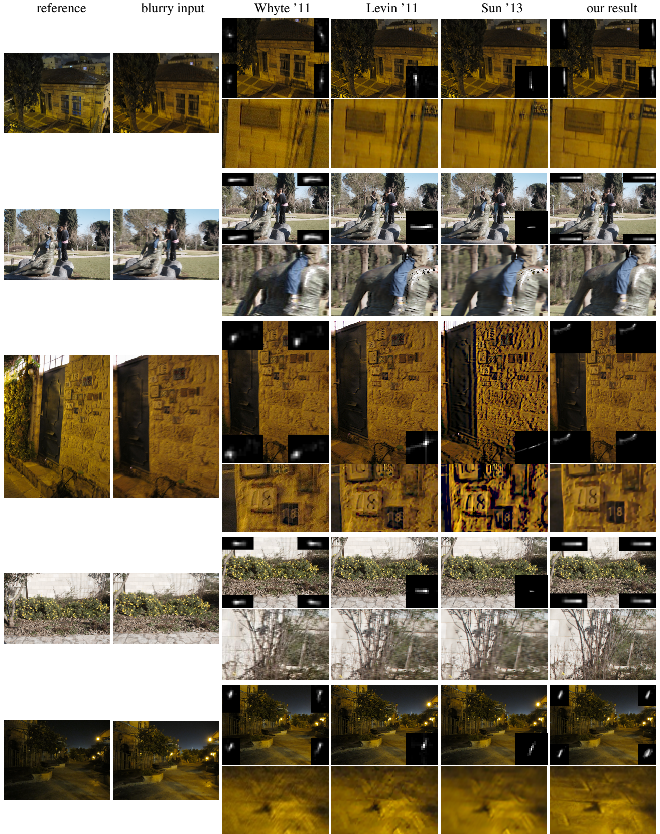
Figure 5. Five real-world sharp/blurry pairs. From left to right: sharp reference; blurry input image; Whyte et al. [25]; Levin et al. [21]; Sun et al. [24]; our result. The odd rows show a deblurred result with the recovered blur kernel(s) and the even rows show an enlarged portion of the deblurred results.