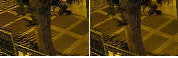
Figure 2. An example for an improvement by using our non-uniform model applied on the top example in Fig. 5 (zoom on lower left corner). Left column: Our method with a single block (uniform model). Right column: Our method applied with the default 12 blocks.

model the blur as a set of convolution kernels, each estimated inside a different block (tile) of the image, while corresponding coefficients of kernels from adjacent blocks are regularized to be similar. Formally, we define the blur function as A_{\mathbf{k}} = \sum_{b,i,j} \mathbf{k}_{b,i,j} P_{b,i,j} where P_{b,i,j} denotes a matrix that offsets the image block b by (i - c_x, j - c_y) pixels while zeroing the rest of the image ( c_x and c_y are defined as half of the kernel dimensions).