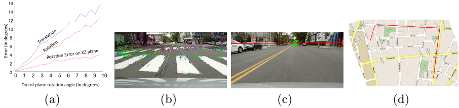
Fig. 2. (a) Simulations to study the sensitivity to out of plane rotation. The red and blue curves show the error in rotation and translation respectively. (b) We show the epipole (white circle) obtained from the intersection of the line segments showing the point correspondences from two consecutive images. For a car moving on a planar road, these epipoles should lie on the horizon. (c) We show the horizon (red line) and a trajectory of epipoles. The green line segments show the trajectory of the epipoles for several consecutive pairs of images. Note that the epipoles do not lie on the horizon. (d) We computed the motion parameters for 3400 images in a video sequence from a GoPro camera mounted on the front of a car. We project the computed trajectory on the Google Earth’s aerial image. The entire trajectory is approximately 1 km long.