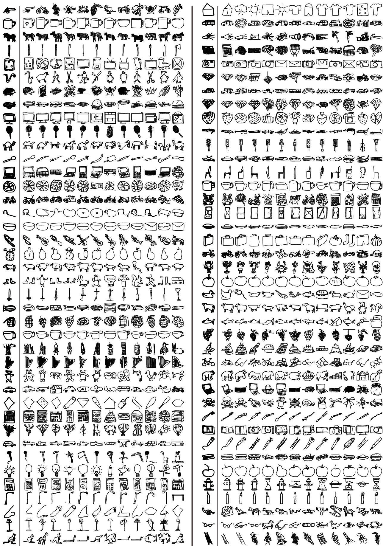
Figure 3: Sample rank 12 retrieval results on the TU Berlin sketch data set by the proposed algorithm.