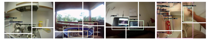
(a) Object-centric cuts