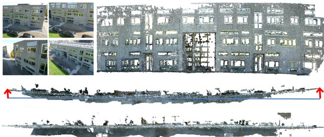
Figure 1: Reconstruction of a facade shows that though visually correct in appearance, geometric inconsistencies (significant bends along the fringes) are prevalent when using calibration and undistortion results from OpenCV (middle). In comparison, using accurate camera parameters delivered by the proposed method results in a straight wall (bottom).

Our calibration routine follows the basic principles of planar target based calibration [4] and thus requires corresponding points to be imaged in several views. However, we use marker patterns printed on several sheets of paper and laid on the floor in an approximate grid pattern (see Fig. 3) to obtain those correspondences. There is no strict requirement for all markers to be visible in the captured images. To ensure that each marker is classified with a high degree of confidence and to eliminate