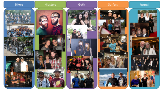
Figure 2: Examples of social groups in our Urban Tribes dataset. The images show a wide range of inter-class and intra-class variability. More details can be seen at the dataset website.

Results. We set up classification experiments where training and testing images were randomly selected from each of the categories for 50 different iterations. For each experiment, a fixed number of the images from each class are used for learning the models and the rest of images are used for testing. An image is correctly classified if the most likely group label matches the ground truth labels. In Fig. 3, we provide confusion matrices for classification results using two different modeling approaches.