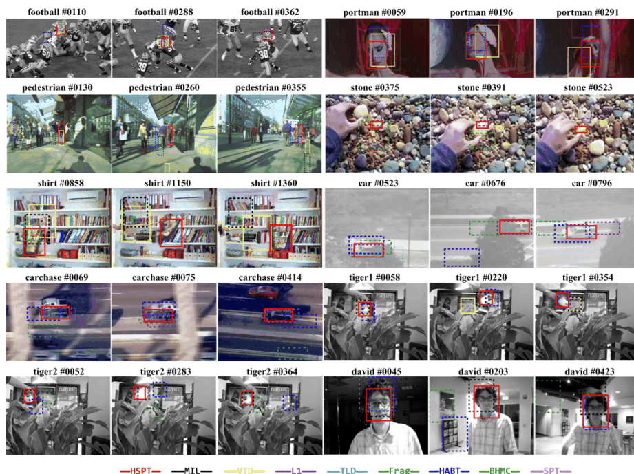
Fig. 3. Tracking results of different trackers. Only the trackers with relatively better performance are displayed.

tween neighboring parts. The experiments demonstrate the superiority of the proposed method. In the future, we will optimize the codes to make the tracker run in real-time.